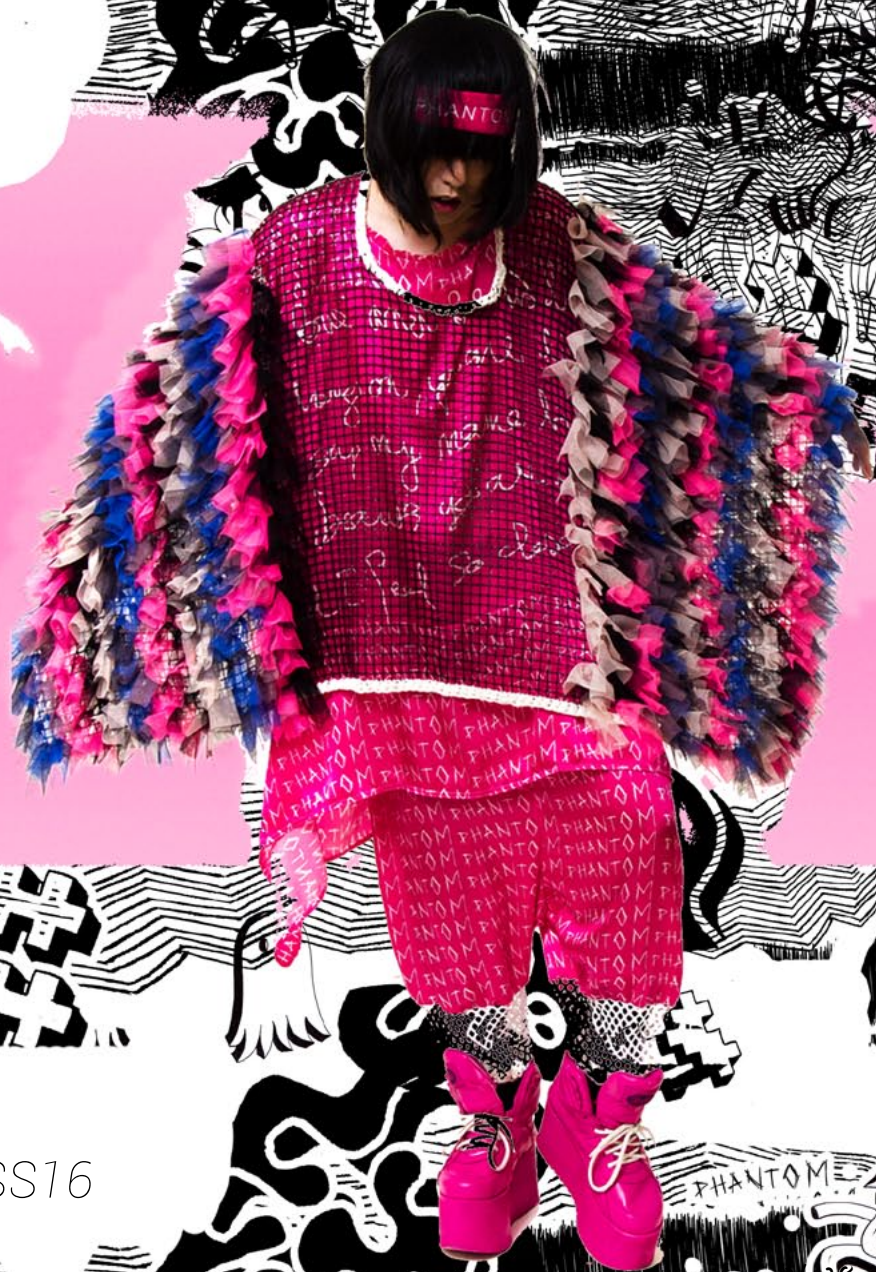
TATA CHRISTIANE PHANTOM LOOKBOOK SS16